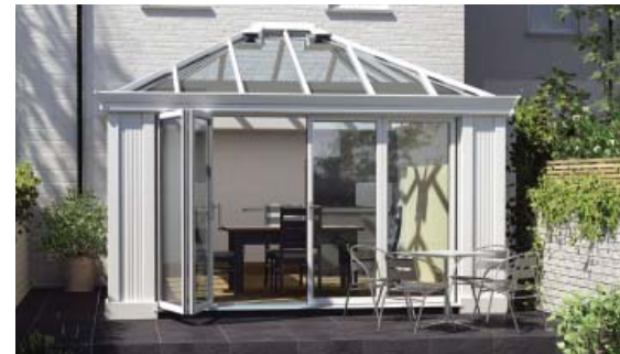
... and NOW instead of brick columns consider the new super insulated Loggia columns.