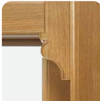
Run through horns Ideal for properties in conservation areas*