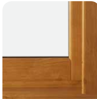
Deep bottom rail Ideal for properties in conservation areas*