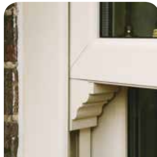
Decorative horns Shown in Cream