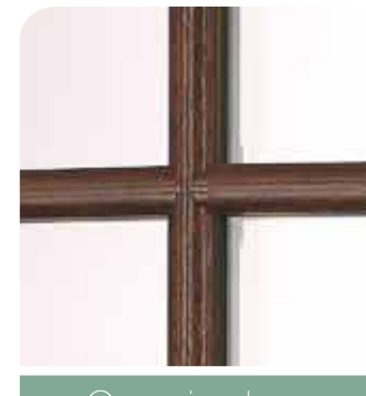
Georgian bars Shown in Rosewood*

Our vertical sliding sash windows enable you to achieve a classic, distinctive look for your home, with all the high-performance, low-maintenance benefits of PVC-U. And they're suitable for conservation areas too – we've recently added a deep bottom rail and decorative run-through horn to the range for the ultimate in traditional looks.