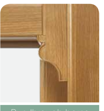
Run through horns Ideal for properties in conservation areas