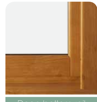
Deep bottom rail