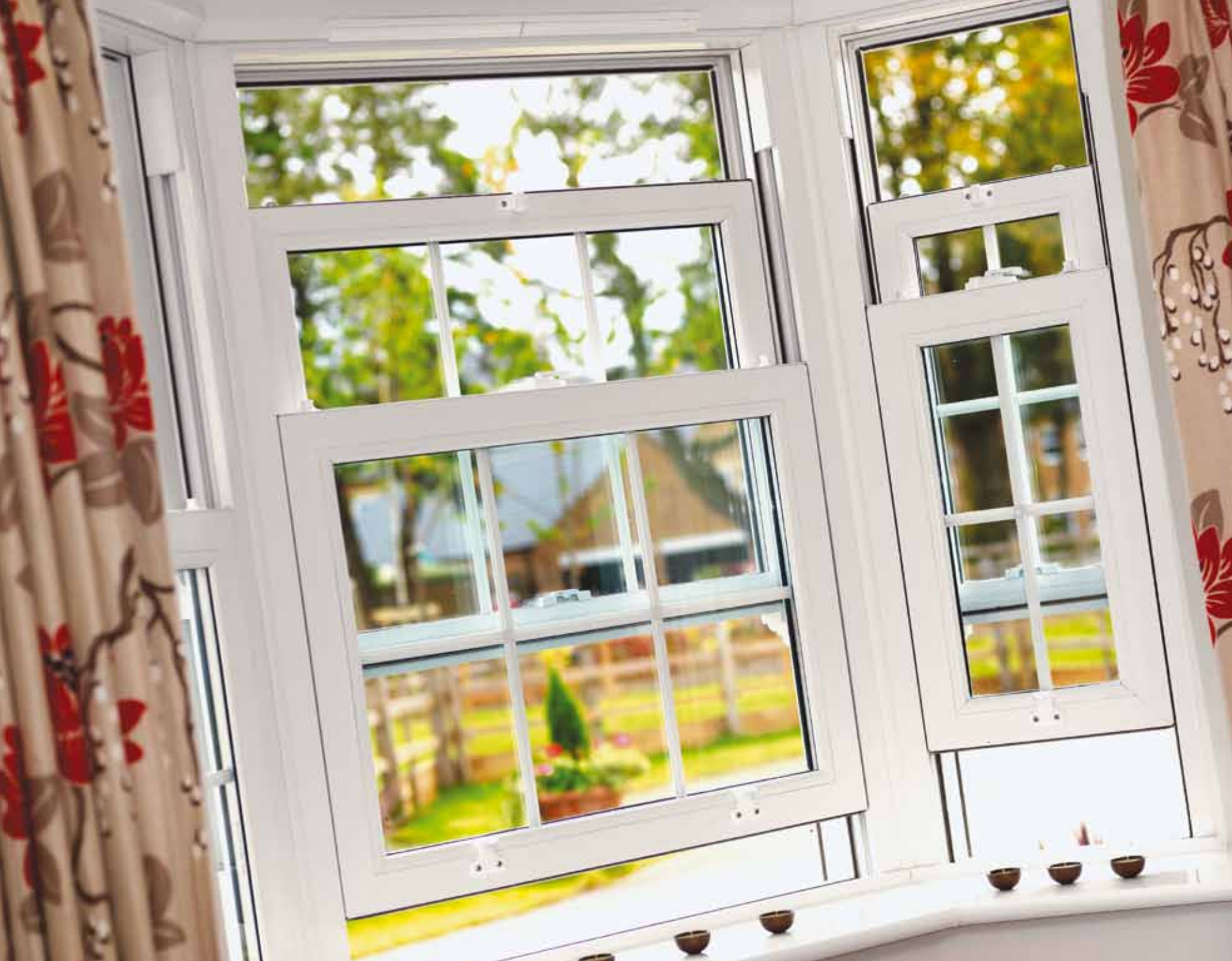
▲ Top and bottom sashes both open, allowing fresh air to enter and stale air to exit, for maximum comfort