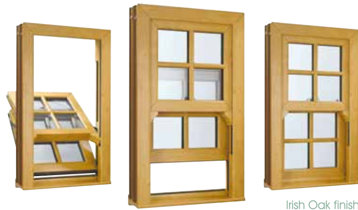
Irish Oak finish

What's more, PVC-U requires very little maintenance to keep your windows looking as good as new. No painting or preservative treatments are required. An occasional wipe down with a damp cloth is all that's needed to keep the frames looking as bright and attractive as the day they were fitted.