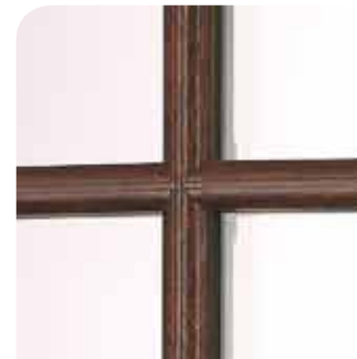
Georgian bars Shown in Rosewood

Our vertical sliding sash windows enable you to achieve a classic, distinctive look for your home, with all the high-performance, low-maintenance benefits of PVC-U. The windows echo the timeless styling of the Georgian era, with two sliding sashes, decorative horns and sculpted ovolo frames.