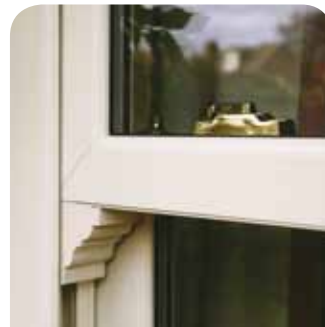
Decorative horns Shown in Cream